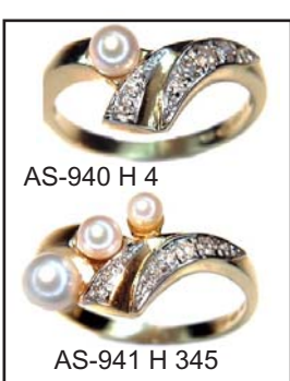
AS-940 H 4