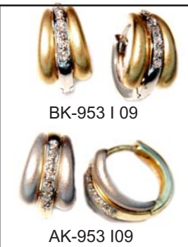
BK-953 | 09