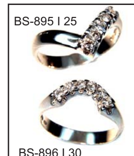
BS-895 | 25