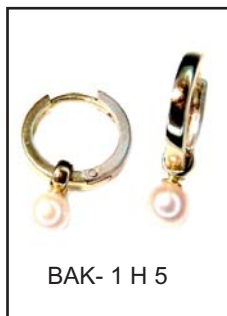
BAK- 1 H 5