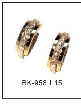
BK-958 | 15