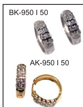
BK-950 | 50