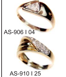
AS-906 | 04