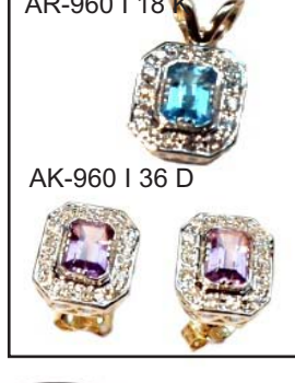
AR-960 | 18