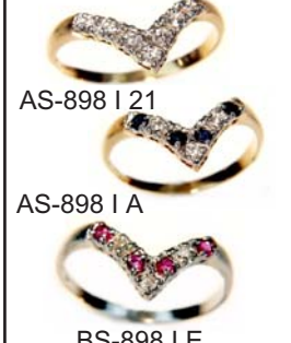
AS-898 | 21