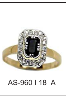
AS-960 | 18 A