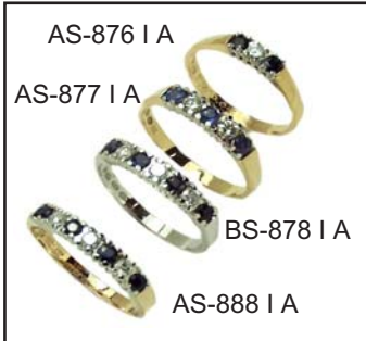
AS-876 | A