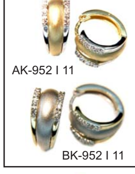
AK-952 | 11