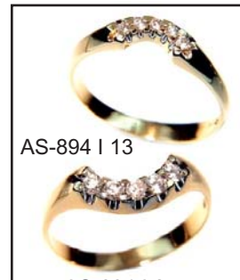
AS-894 | 13