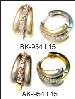
BK-954 | 15