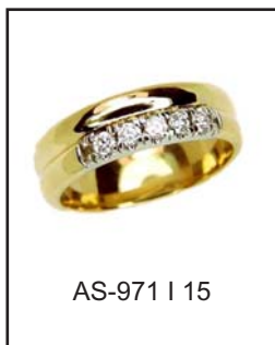
AS-971 | 15