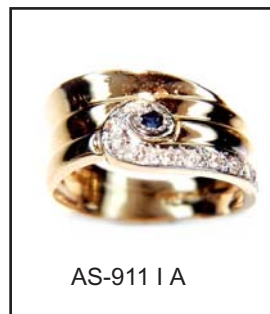
AS-911 | A