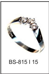
BS-815 | 15