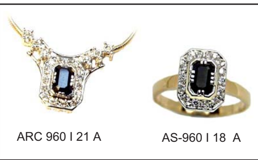
ARC 960 | 21 A