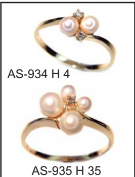
AS-934 H 4