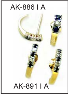
AK-886 | A