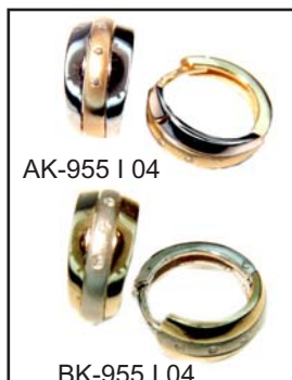
AK-955 | 04