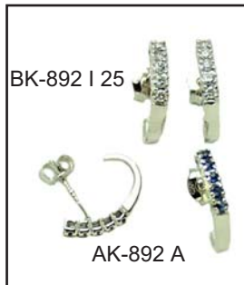
BK-892 | 25