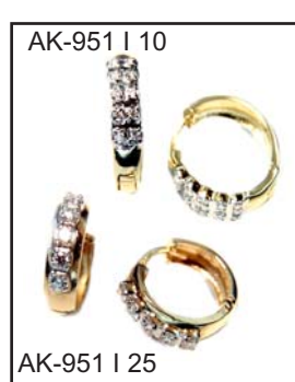
AK-951 | 10