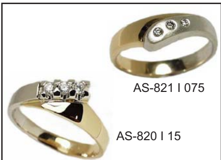
AS-821 | 075